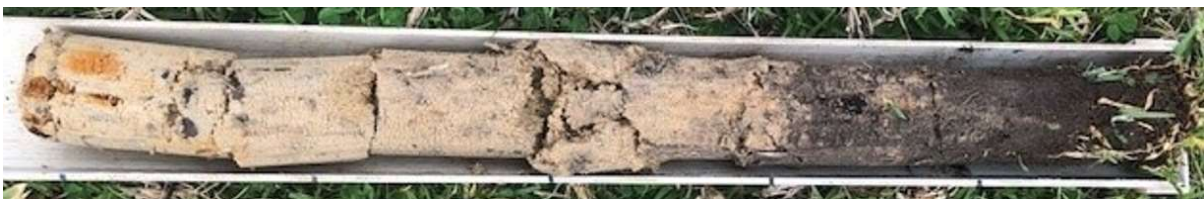
Soil core sample to 500mm at main trial site in Bridgetown

The project commenced in February 2022 with the baseline soil samples taken in April 2022. The image below shows the typical soil type on the main trial site in Bridgetown which is a duplex sand over clay. The site is under surface irrigation and has been growing a kikuyu, ryegrass and clover pasture mix for the past 40 years. There are two trials and three demonstrations within the overall project.